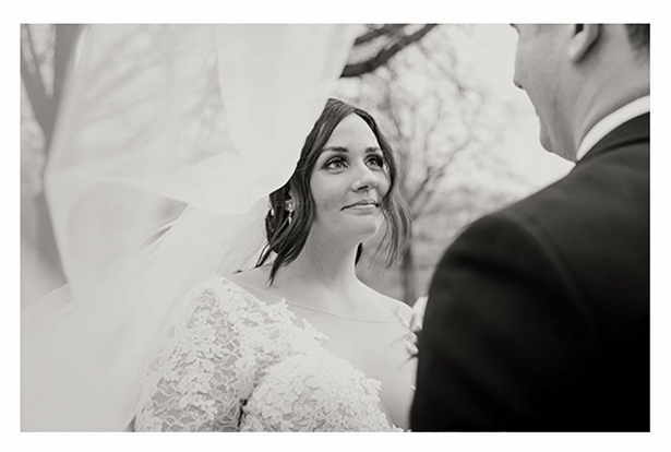
The Ivy + Oak $6,800 10 hours coverage 2 photographers Engagement session 20 Pages Towards 12x12 Wedding Album Two, 8x8 Identical Parent Albums Complimentary 5x7 flat Thank You's with envelopes